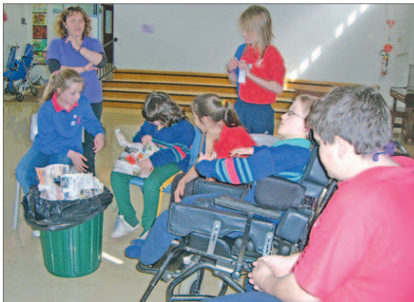
Students in Units E & H conduct research on native animals at the Tasmanian Museum.