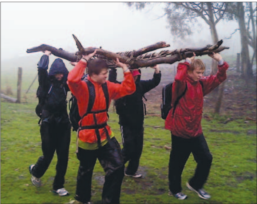
Some local boys weather the elements and learn teamwork and survival skills on the Bridgewater PCYC's BEAT program.

depends on the age of the child. For example: • A child under the age of six months is to be restrained in either an approved rearward facing child restraint (infant child capsule). • From six months to less than four years, a child is to be restrained in either an approved rearward facing child restraint or an approved forward facing child restraint with in-built harness (child safety seat). • If a car has two or more rows of seats, then children under four years must not travel in the front seat. If all seats, other than the front seats, are being used by children under seven years, children aged between four and six years (inclusive) must travel in the front seat, provided they use an approved child restraint or booster seat. The penalty for failing to ensure a child less than 16 wears a child restraint or seatbelt as required is three demerit points and a $350 fine. On behalf of all members of the Bridgewater Police Station we wish everyone in the Brighton municipality, a very happy and safe Christmas and New Year.