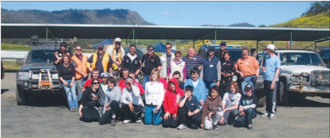
Trekka 4WD club members thoroughly enjoyed providing a muddy fun day out for CanTeen members.

consolidated overarching set of strategies, and identified issues and areas where further detailed planning work is necessary. This additional work, phase two, has been progressed to draft stage, and the four councils are now seeking the views of the community. The draft documents are available on the councils' websites and hard copies are available for inspection at the various council offices. Community consultation is being held at various locations and submissions may be made in writing by Friday, January 29.