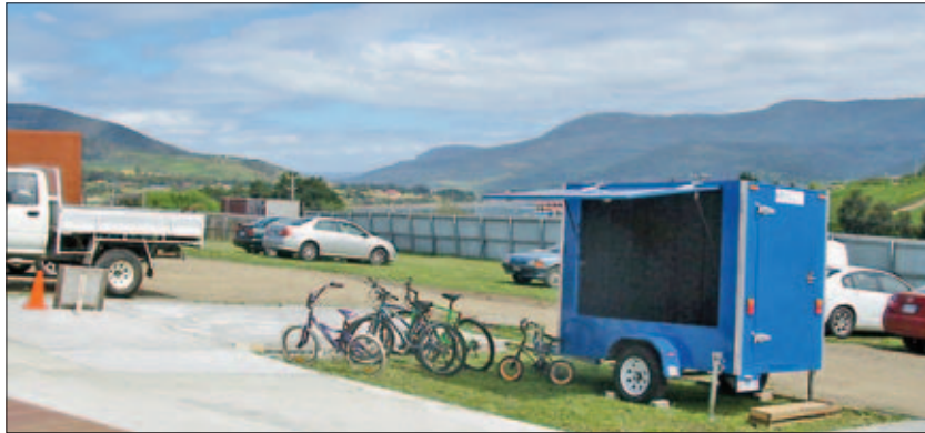
The new food distribution trailer was built 'from the wheels up' by Choose Employment Work for the Dole participants.

"And there are obvious benefits for the many homeless and disadvantaged people who often rely on Louie's Van for their only proper meal each day."