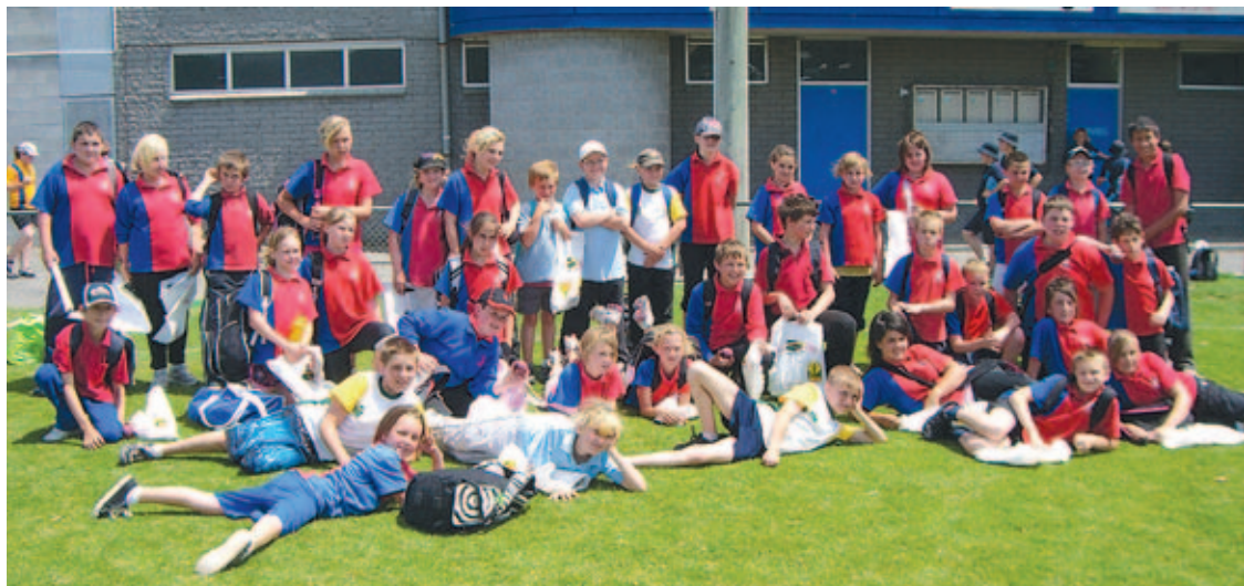
Gagebrook Primary students were well represented at the Milo cricket day recently.

We look forward to seeing many old and new faces at the footy in the upcoming season.