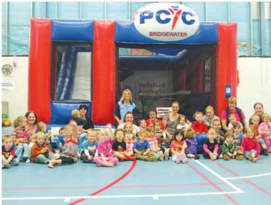
The children from the Brighton Family Day Care enjoy the new jumping castle.