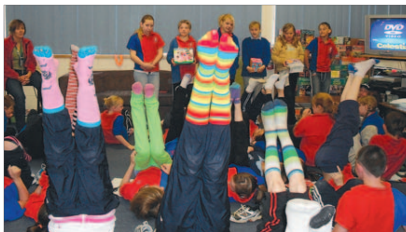
ABOVE: Students raise funds for the Ronald McDonald Learning Program by hosting Tasmania's first Silly Socks Day.