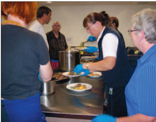
A hive of activity: volunteers at work in the kitchen