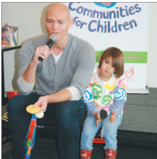
Michael Klim talks to children at the Brighton Civic Centre and proudly displays some of his Olympic medals.