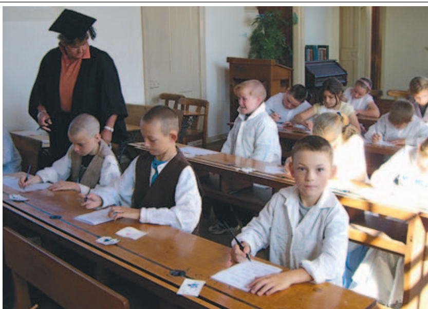
A visit to the 'old school' was a highlight for some of the Gagebrook Primary students.

THE total March rainfall for Brighton township was 48.6mm over 10 days bringing the total for the year to 97.6mm.