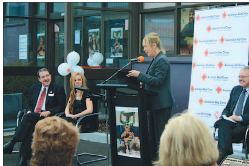
Minister for Human Services Lin Thorp opens the new Red Cross office.

see the Red Cross embrace this philosophy."