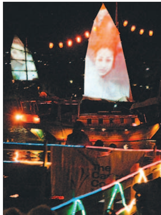
The traditional Chinese junk, the Suzy Wong , drifts by, her sails set and filled with moving imagery.