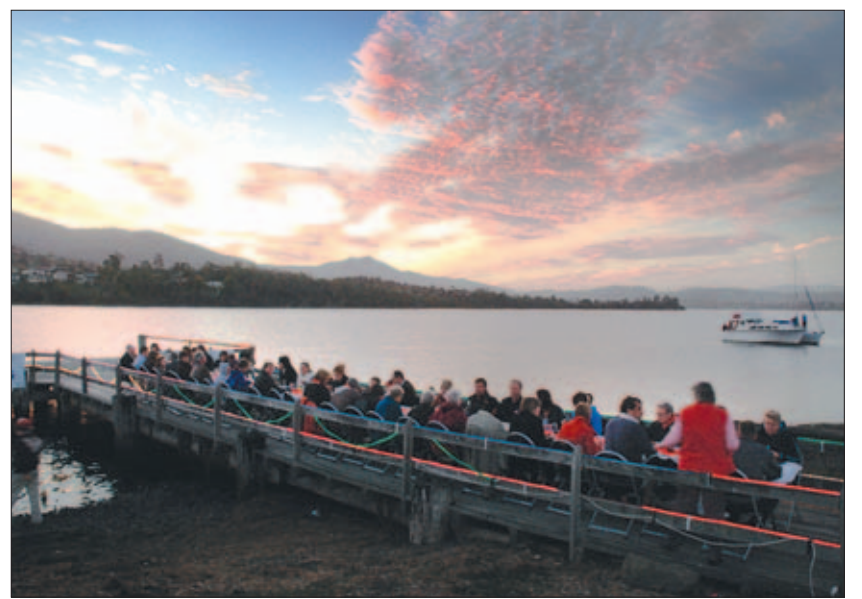
Diners at the long table enjoy a beautiful meal on a wonderful night.