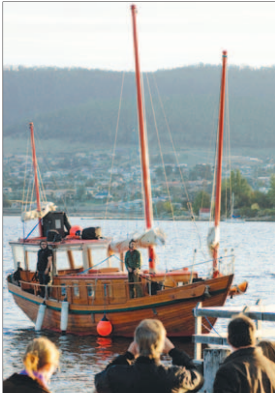
Traditional Chinese junk, the Suzy Wong before the show.