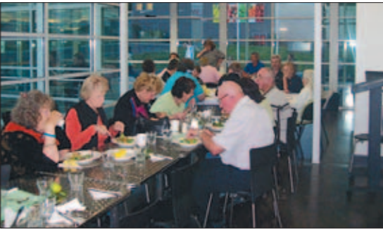
Guests (above right) enjoyed a wonderful get-together along with great food prepared by volunteers (right).

Many thanks go to all the volunteers for their tremendous help and also to the supporters of Dining with Friends. The new Loui's Van service operates on a Monday night from Herdsmans Cove Primary School from 6.55pm-7.15 pm and Work-skills car park, Bridgewater, from 7.20pm-7.40pm. The Friday night service will continue as usual.