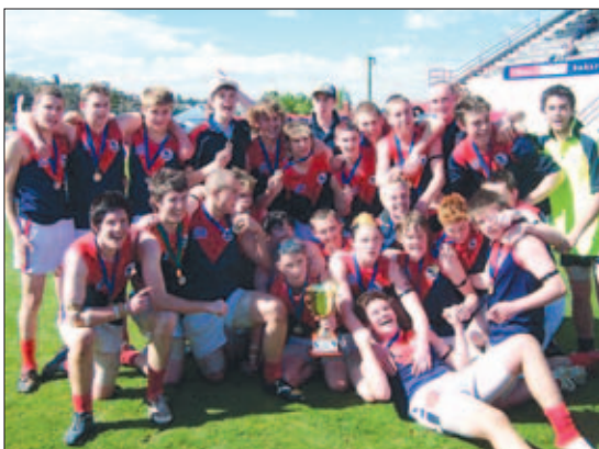
Right: the victorious Brighton Colts team – teamwork, guts and determination won them the grand final.

The boys had a great week together, watching footy, playing golf, training hard and bonding with a players' tea.