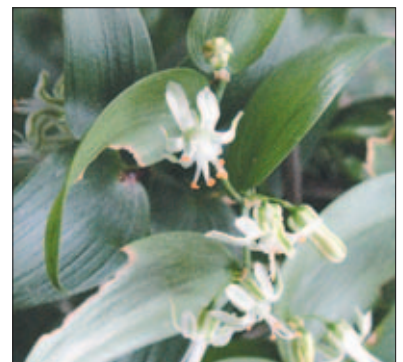
Bridal creeper: one of the nation's worst weeds, invading mainland Australia and parts of Tasmania

Pea-sized berries turn from green to dark red and