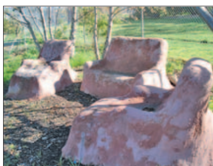
Riverside Nursery Grow and Learn seating.

Or if you wish, just join the team for a coffee and a chat and come and have a