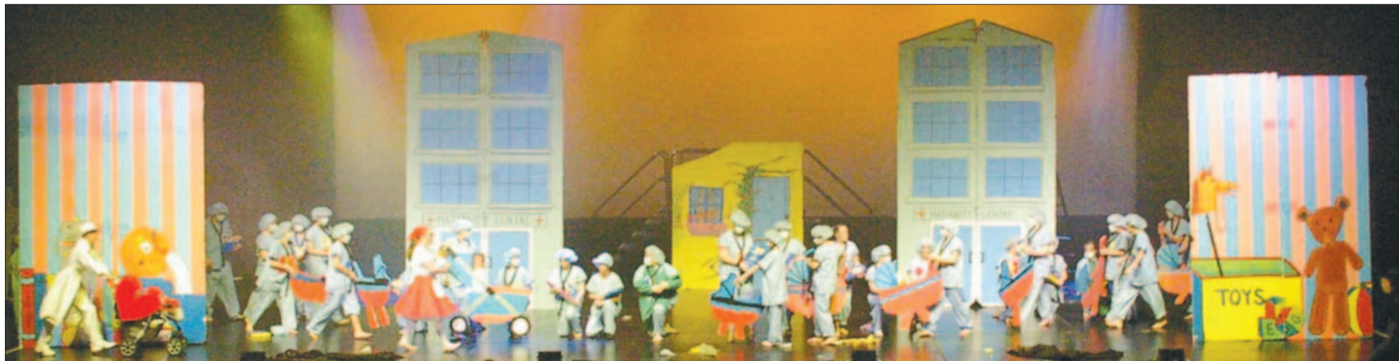
This scene in Bridgewater High School's 2009 Rock Eisteddfod production represents the arrival of new life.