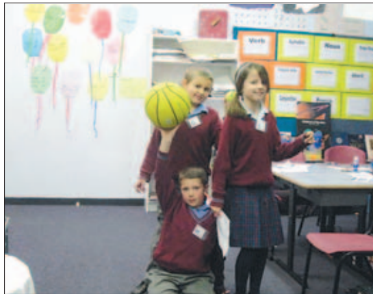
Students at St Paul's Bridgewater are making the right connections with science.

eracy enriches the learning experience for students.