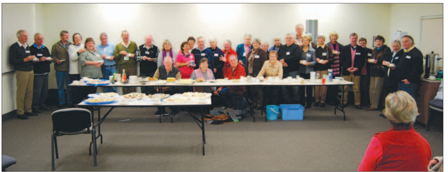
A highlight is the School of Senior's fourth birthday celebration.

"Housing Tasmania is working with Tasmania Police to investigate this matter."