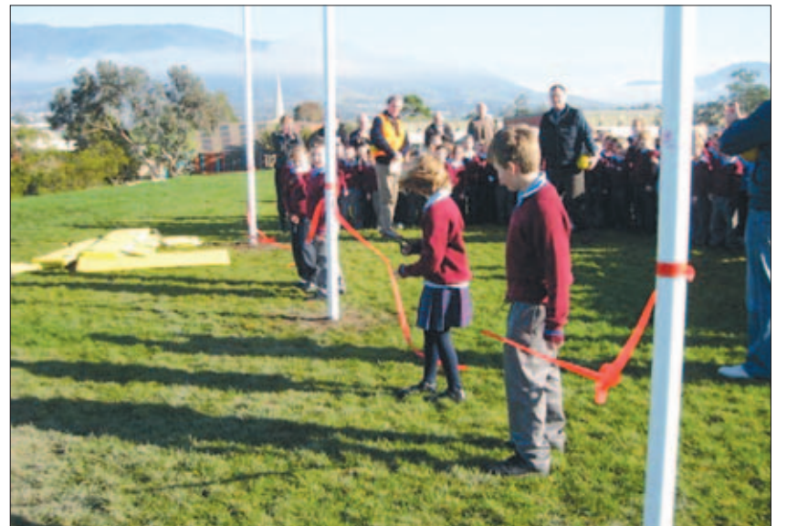
Students at St Paul's enjoy the 'cutting of the ribbon' of the newly refurbished oval's goal posts.

Congratulations to everyone at Gagebrook Primary School.